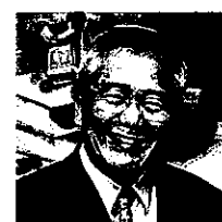
Purdue University Distinguished Professor Mr. Ei-ichi Negishi (Teijin Group Distinguished Fellow) 5th year Teijin Kumura scholarship (1957)

When you find your own "Dream", please challenge it thoroughly until the truth is investigated. I look forward to your great success in the future.